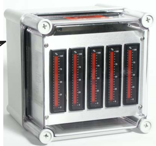
BinMaster SmartSonic Display Module Enclosure with 5 Bargraph Display Modules

SmartSonic bargraph display modules can be used with any of the SmartSonic Ultrasonic Transmitters for remote indication of tank level. The display modules are available with optional relay outputs to provide process control and local alarms, and process loop analog output modules to be used to retransmit SmartSonic vessel data to a PLC/DCS or other analog devices.